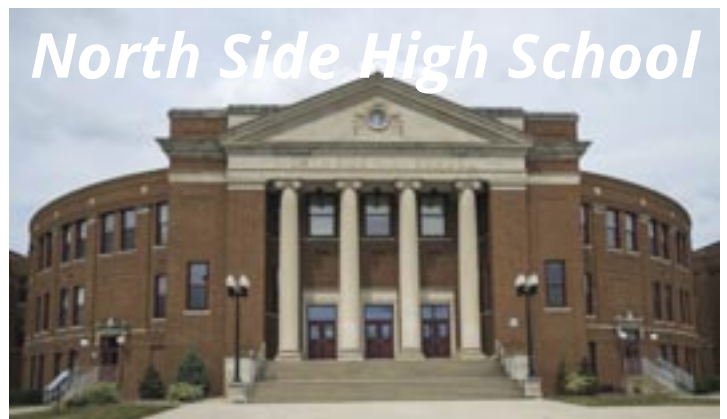
North Side High School