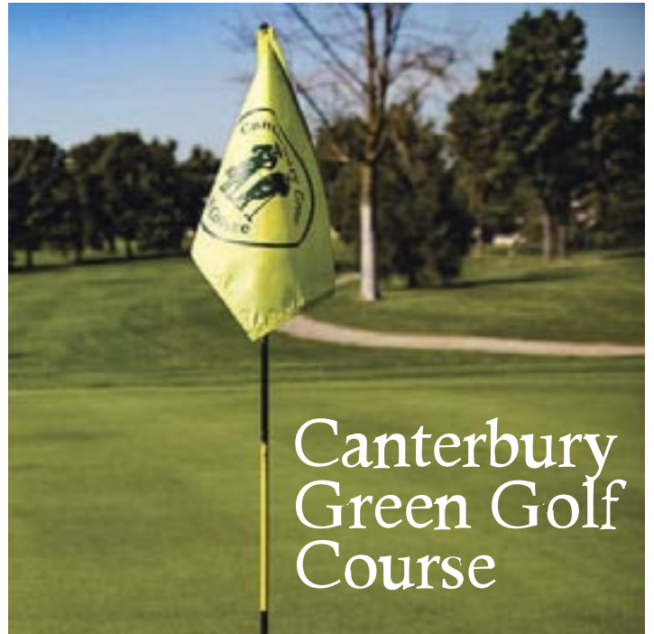
Canterbury Green Golf Course