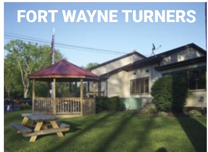
FORT WAYNE TURNERS