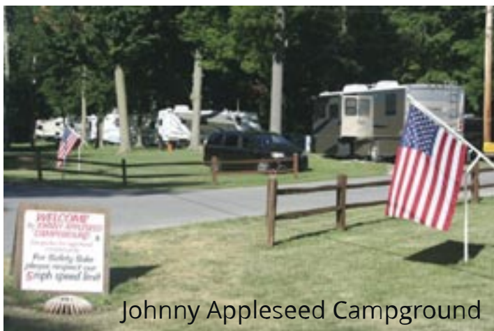
Johnny Appleseed Campground