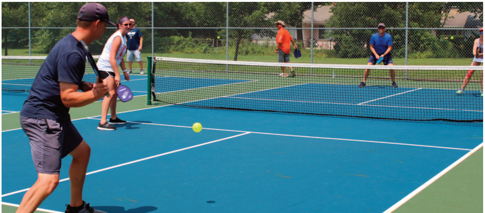
2019 Festival Pickleball