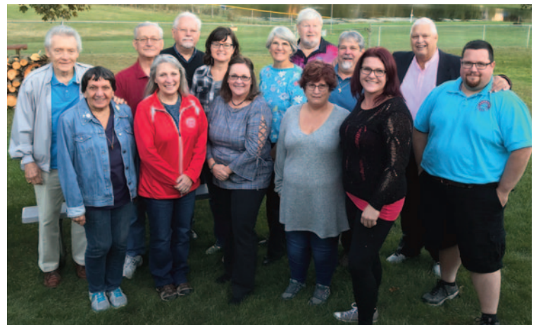
2019 National Council