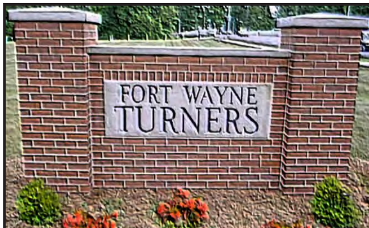
▲ HOST OF THE 2023 NATIONAL SOFTBALL TOURNAMENT, FORT WAYNE, IN