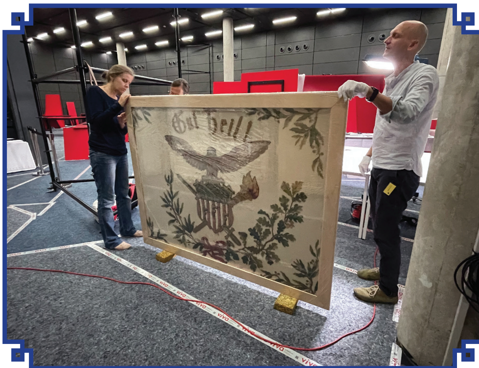
American Turner banner going on display at a German museum.